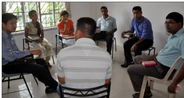
Spiritual formation group meets every Wednesday