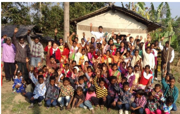
House Church among the Adivasi (Tea Tribe)