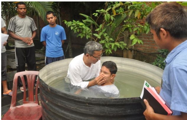
New believer in Christ