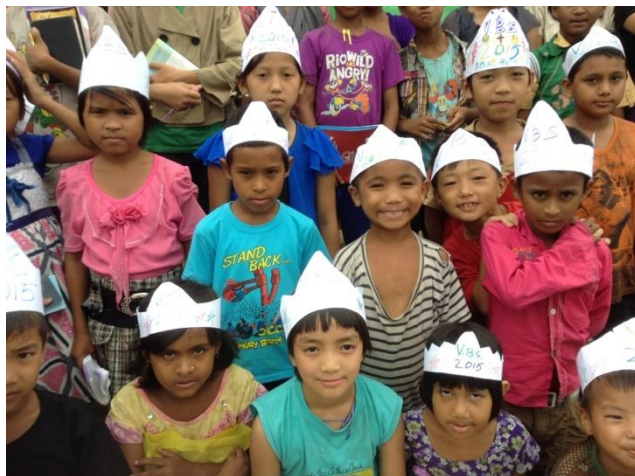
Vocational Bible School